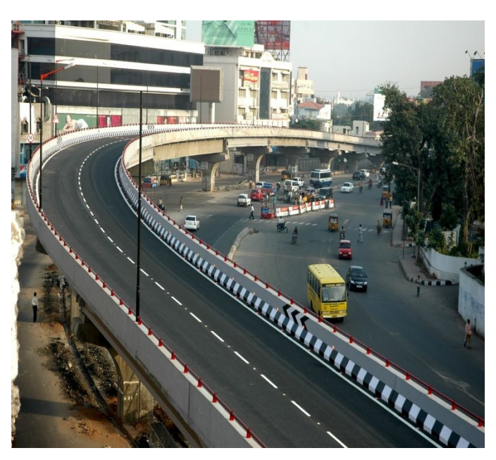
Flyover at Greenlands Junction, Hyderabad, India