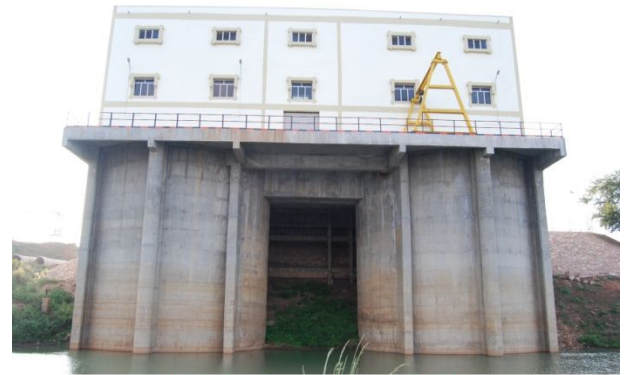
NAGARJUNA CONSTRUCTION COMPANY LTD Tadipudi Lift Irrigation Scheme Pump house - II