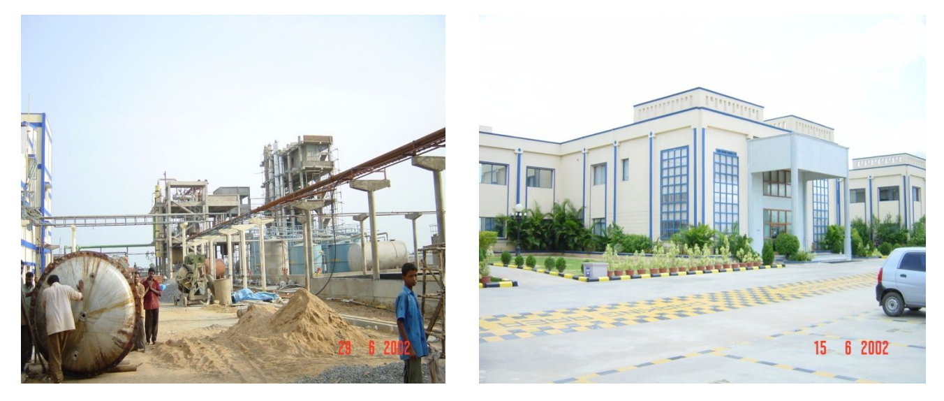
Aurobindo Pharma, Vizag

PRAGATI CONSULTANTS has also gained an outstanding reputation in the realm of consulting engineering for designs of Industrial and Residential Buildings. The Clientile includes Major Industries like Aurobindo Pharma, Autus Pharma, Hetro Drugs, Soveringn Distilleries, Pionear Distiliers, Bharat Biotech, Inox, ITC etc.