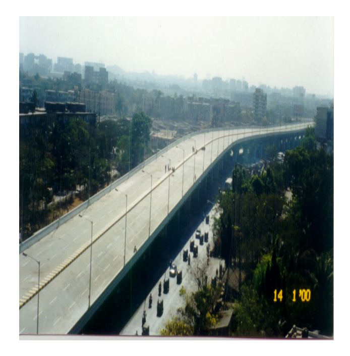
Flyover at Kalina and Vakola Junctions, Bombay, India